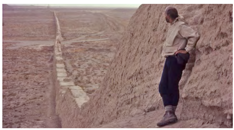
Below: Silk Road travellers entered China's heartland at Jiayuguan, the 'Jade Gate'. For the Chinese, it used to mark the westernmost outpost of civilization.

Below: The Great Wall in the Taklamakan Desert.