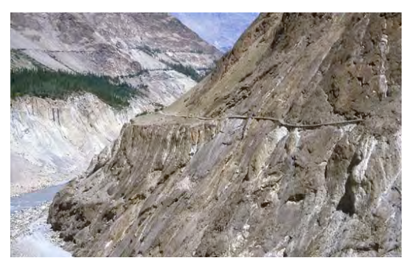
Left: Clinging to the cliff face, some parts of the old Hunza Road are less than two feet wide.