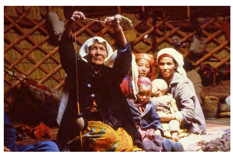
Inside her yurt, this Kirghiz great-grandmother plays a central and highly respected role in family life.