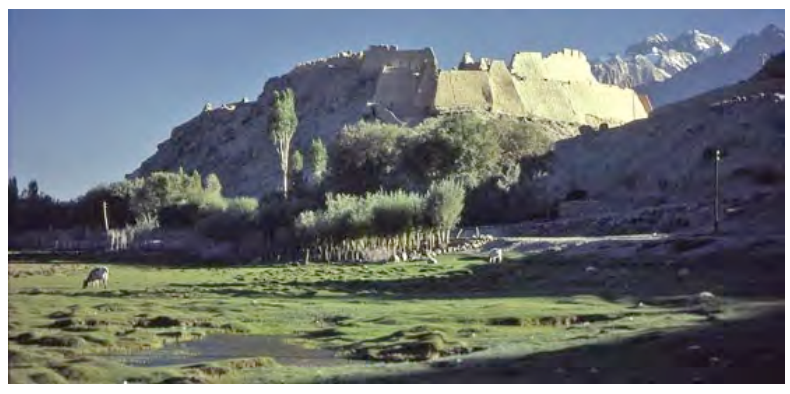
Above: A Manchu fort dominates 2,500-year-old Tashkurghan, one of the oldest caravanserais on the Silk Road.