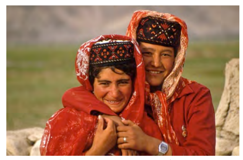
Tajik women – 'the most sumptuously dressed on the Silk Road'.