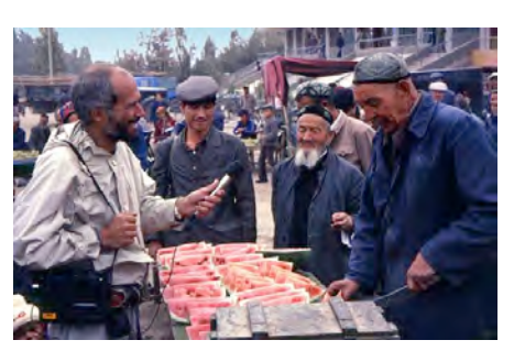
Left: Recording an interview in Turfan's bazaar. People were surprisingly candid in front of the microphone.

Below: The Great Wall in the Taklamakan Desert.