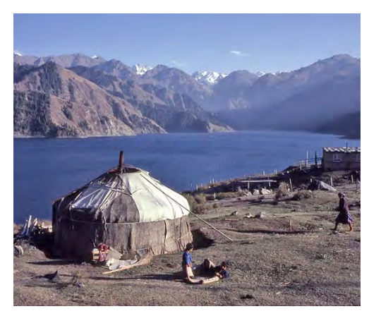
Right: My home by Lake Tianchi – a Kazakh yurt .