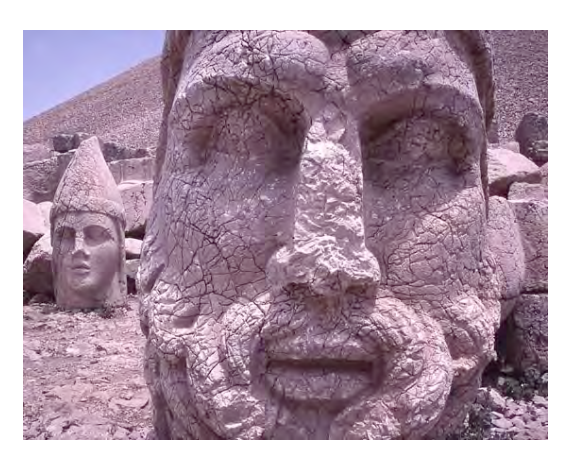
Left: The summit of Nemrut Dağı in eastern Turkey is littered with 2,000-year-old statues which lay undiscovered until 1881.