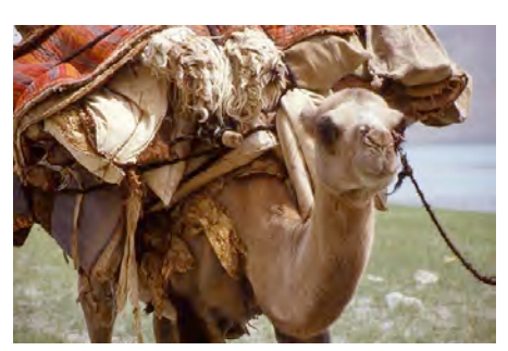
Left: A Bactrian camel is worth eight yaks, nine horses or forty-five sheep.

Below: Reconnoitring the route through the Pamirs.